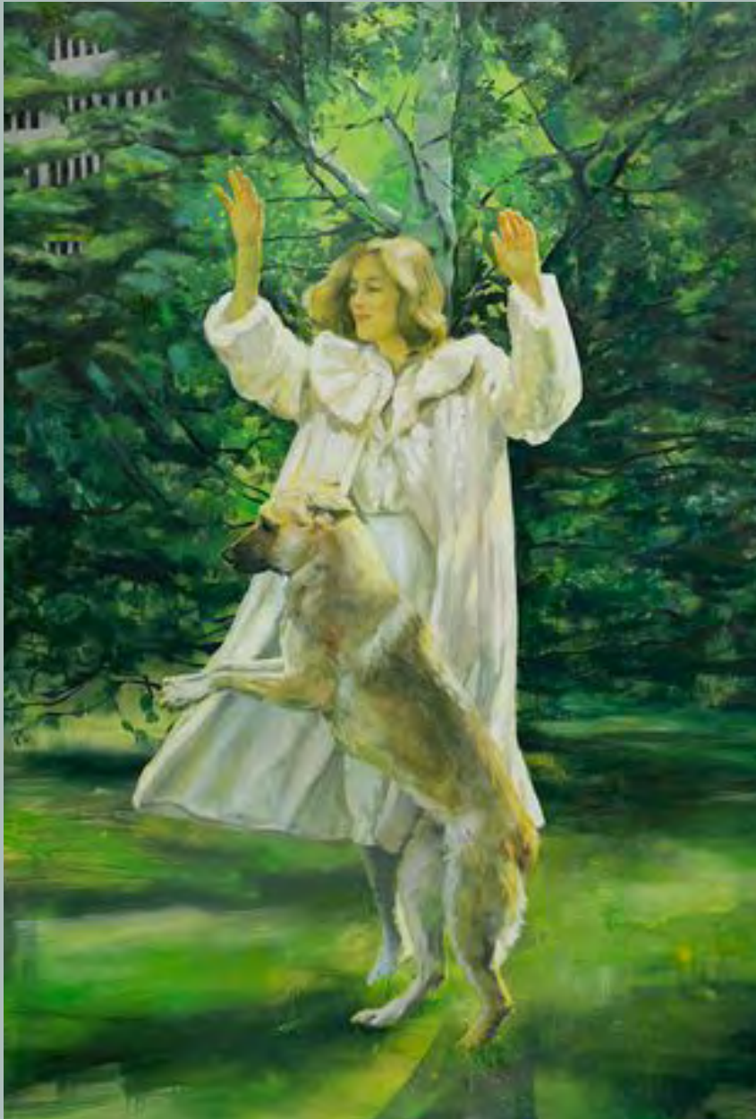
Grazyna, The Modernist, 2021, Oil on canvas, 160 x 100 cm