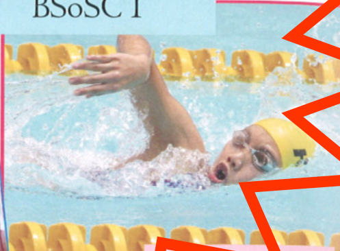
Luk Yan Swimming MBBS I