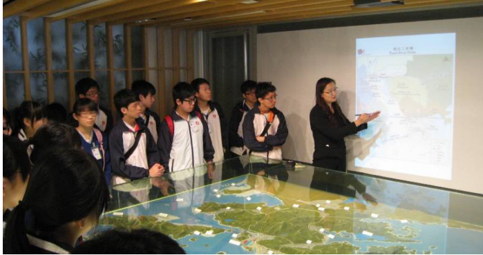
The Chinese Foundation Secondary School @ MTL 中華基金中學 @ 現代貨箱碼頭