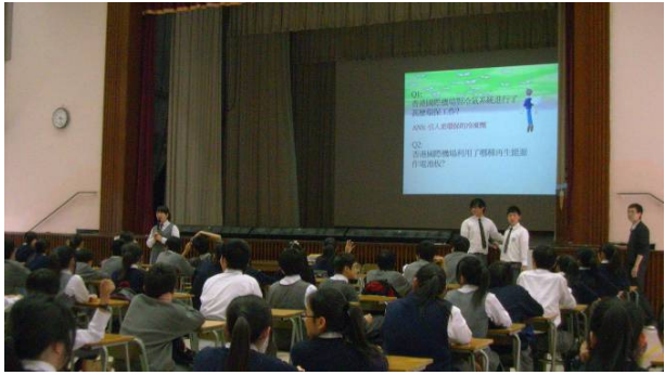
Apr 11: Form 6 students introduced how HKIA practises CS to Form 2 students in Kiangsu -Chekiang College (Kwai Chung).