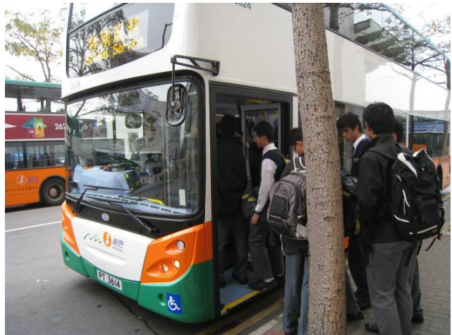
POCA Wong Siu Ching Secondary School@ NWS 寶安商會王少清中學 @ 新創建集團 11 Mar 2011