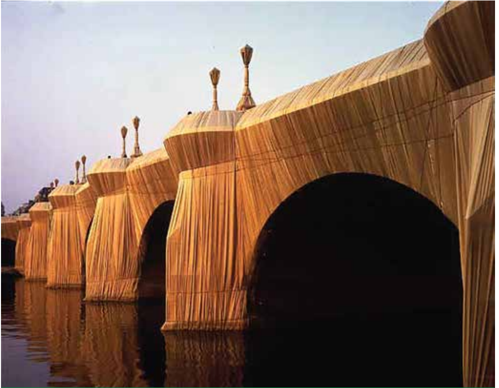
Christo, The Pont Neuf Wrapped, 1975-85