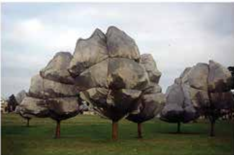
Christo, Wrapped Trees, Switzerland, 1998