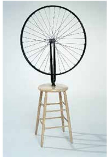
Roue de bicyclette (Bicycle Wheel)

He initiated Dadaism, which changed the form of art to be focused on the concept, and told people that art was no longer just related to painting and sculpture, and concepts and ideas should take precedence.