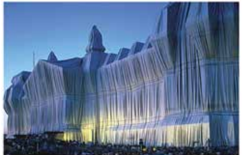
The Reichstag (Berlin) wrapped in silver fabric by Christo, June 1995