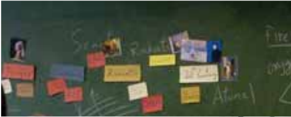
The Timeline of Music and Arts History