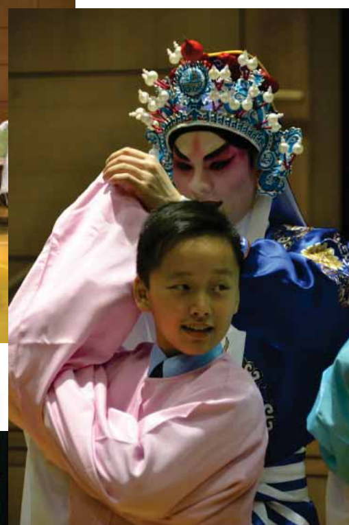
The artist teaching our student “水袖” 表演者正在教學生“水袖”