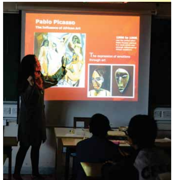
1906 to 1909, was the period when Pablo Picasso painted in a style which was strongly influenced by African sculpture