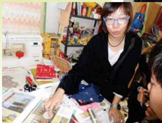
Artist introducing her Art works to our students 藝術家在介紹她的作品予我們的學生