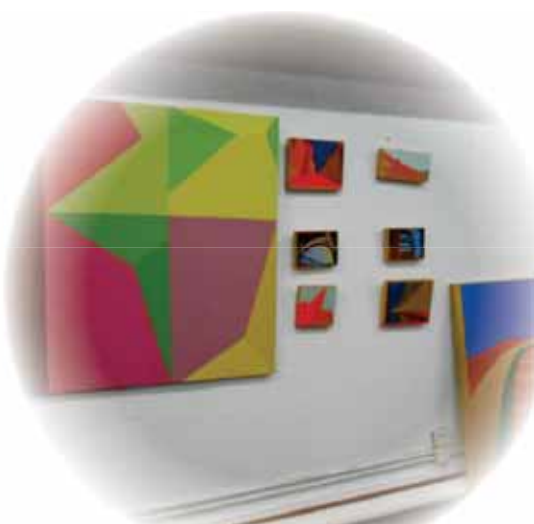
Artist's studio and their Art works 藝術家的工作室與藝術作品