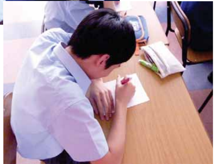
Students listening The Mussorgsky " pictures at an exhibition "