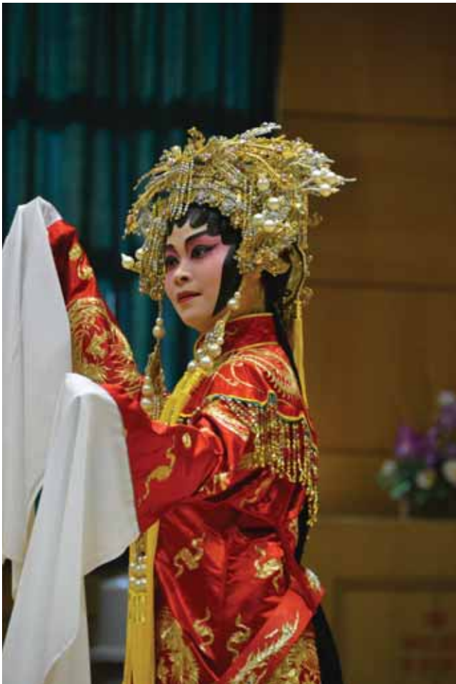
The artist doing the demonstration 表演者正在試範

On 10th December, the guests from Young Friends of Hong Kong Arts Festival introduced the Chinese opera to our students. Students sang “香夭” with guests and performers. We all enjoyed the brilliant and fascinating music performance very much!