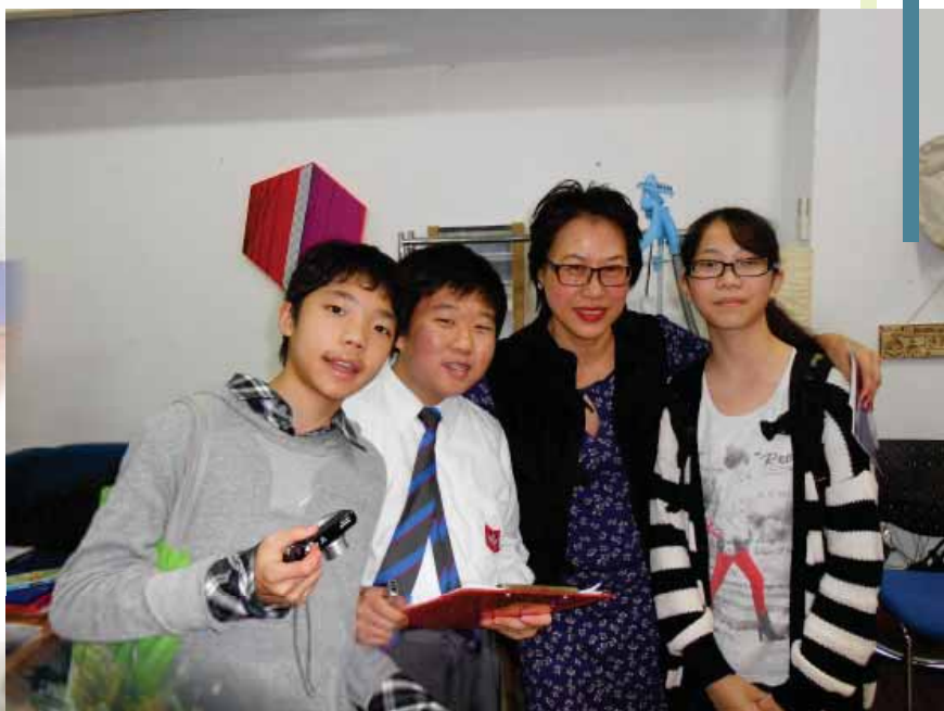
Our students enjoying the sharing with artist 我們的學生皆享受與藝術家分享不同的 藝術構思