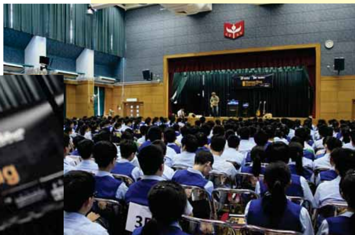
S.1-S.3 students enjoying the guitar music 中一至中三的同學正在享受結他音樂