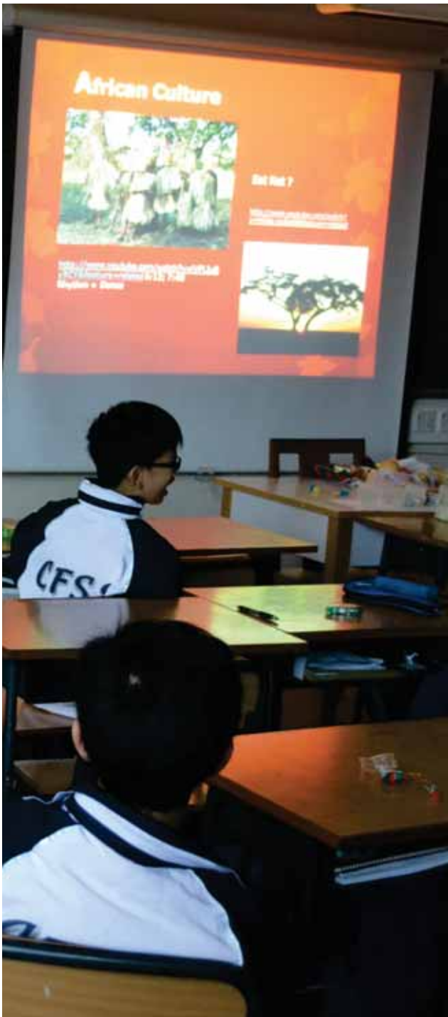
Students discussing the African Culture