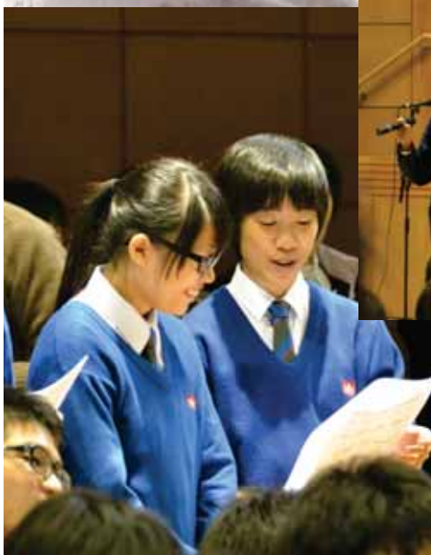
Our students singing “香天” with performer 學生與表演者一起唱“香天”