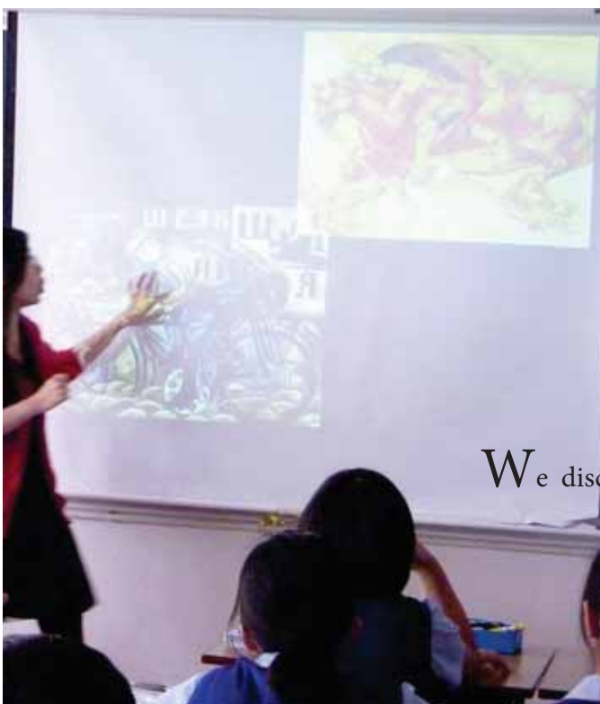
We discussing the style of Russian painting