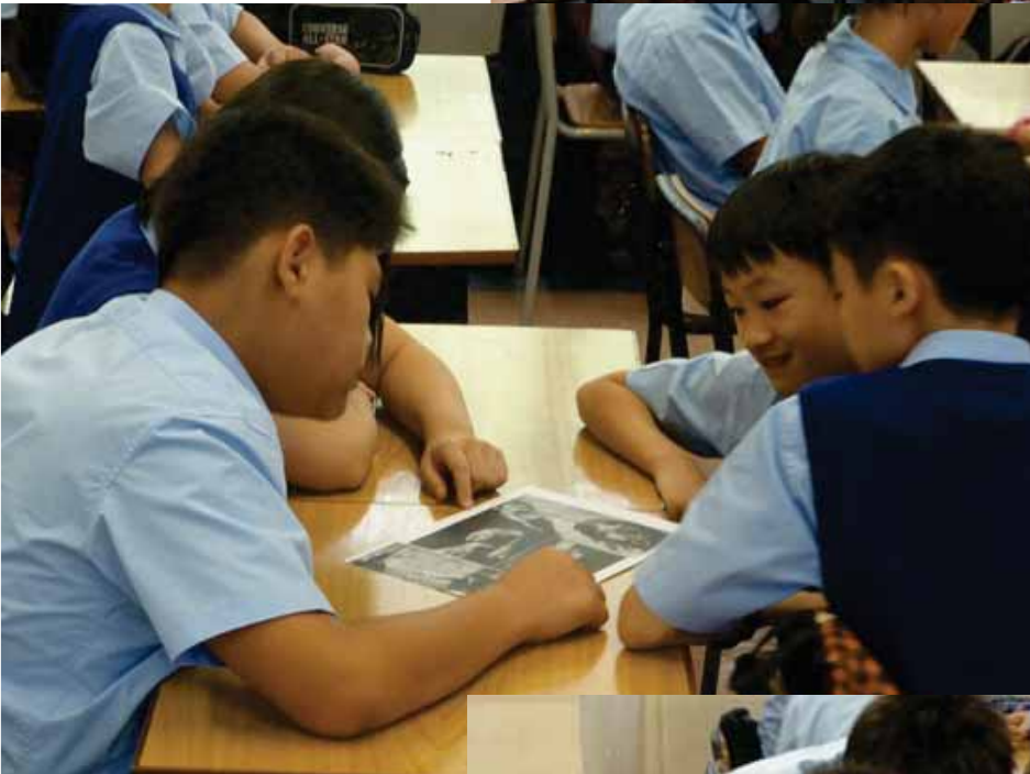
Students having a group discussion of different paintings