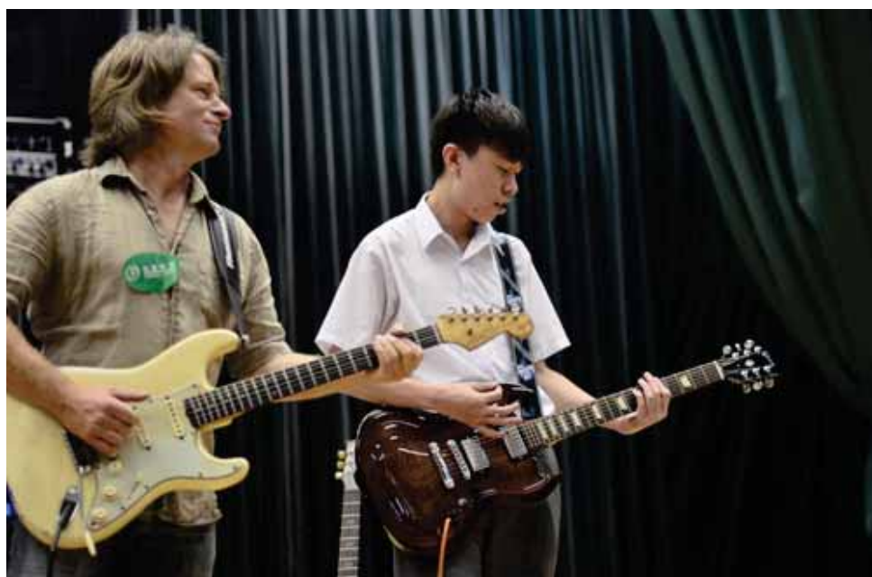
Our students enjoyed playing guitar very much 我們的同學十分熱愛並投入結他音樂！