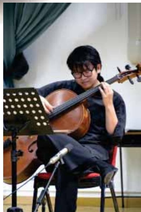
Our students had a wonderful experience with this concert 同學們在這次音樂會獲得難忘體驗