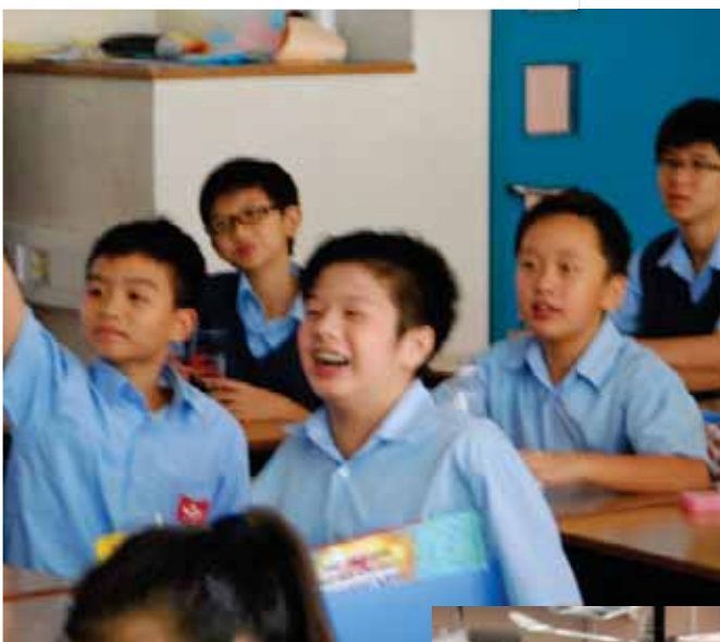
Students having a competition

Date: 14th-21th Nov2012 Location: S.1 Classroom