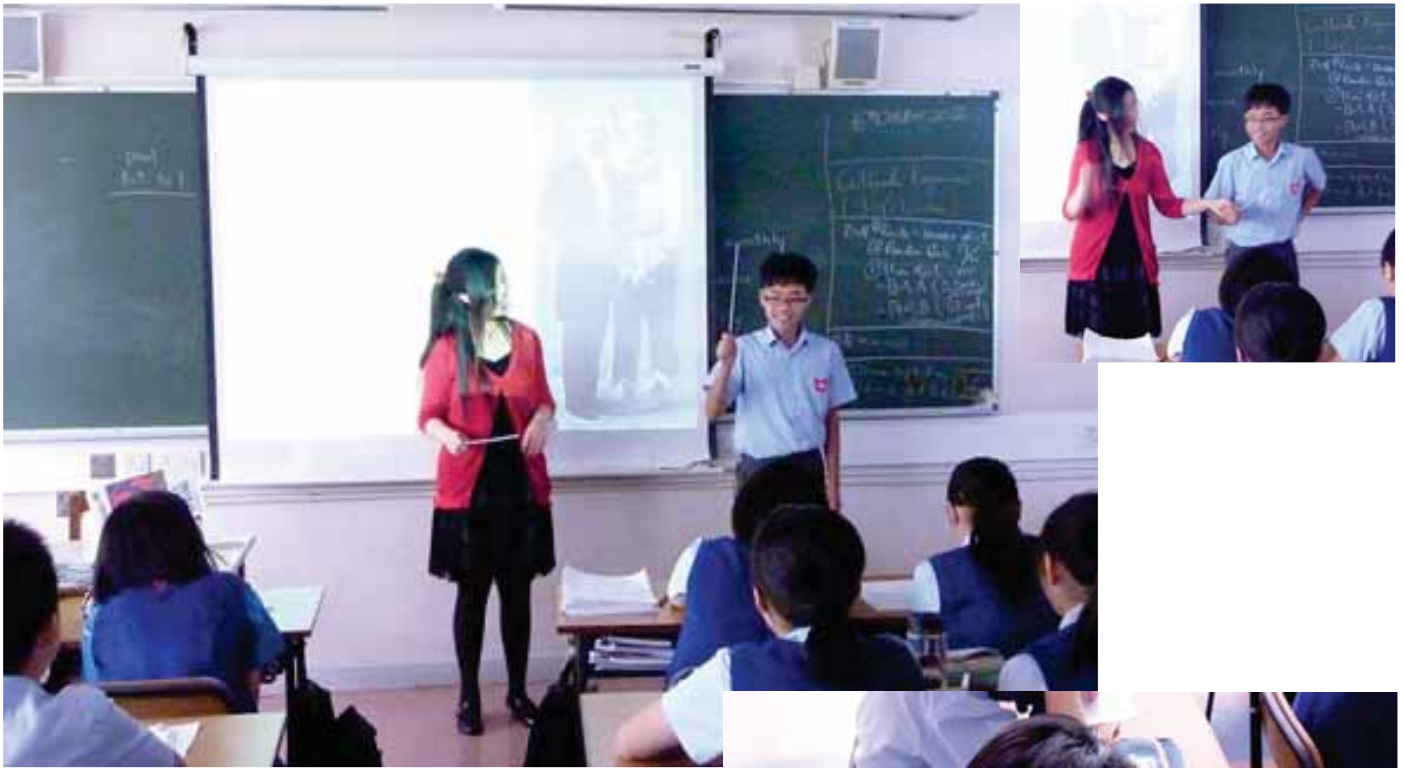
Students learning the conducting technique.