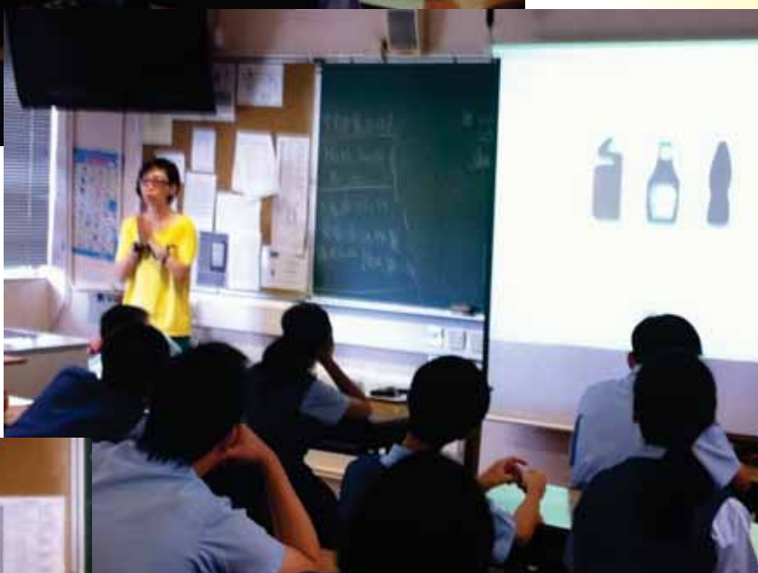
Our guest asking our students questions