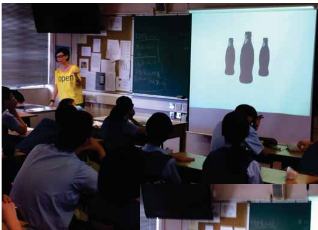
Our guest talking the relationship of living and image