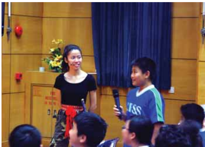
Our students answering question quickly