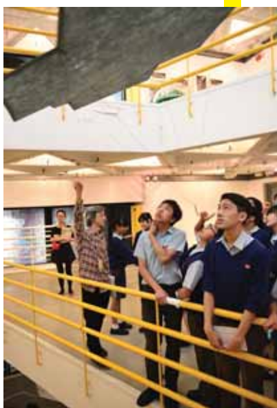
Our S.3 students visiting Hong Kong Arts Center