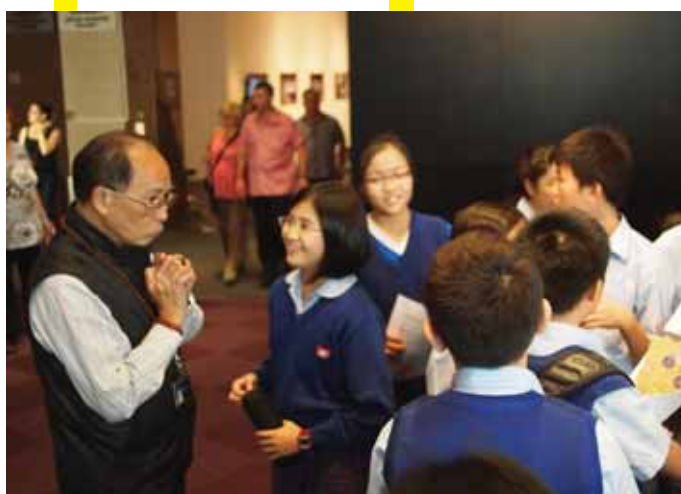
Our students asking tutor about Contemporary Art