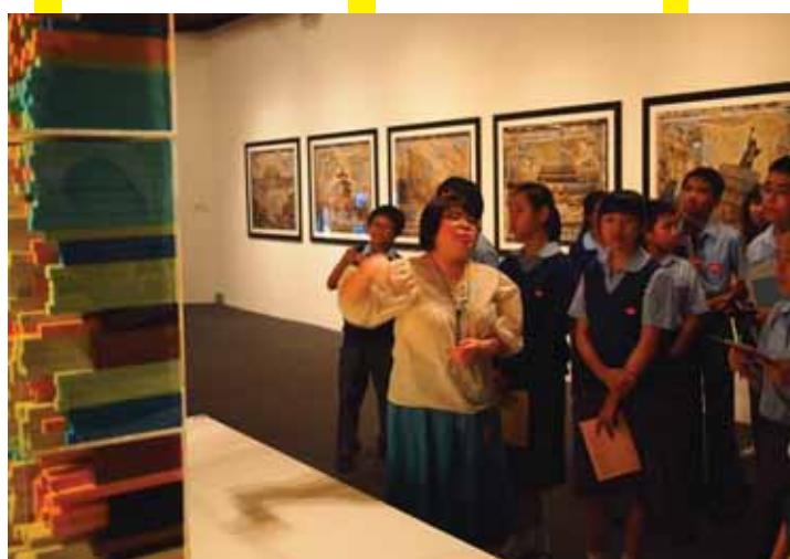
Our S.1 students visiting Hong Kong Arts Museum

Date: 5 th November Time & Location: 8:30 a.m - 1:00 p.m Hall/ SAC/ Classroom 2:00 p.m - 4:00 p.m Arts Museum