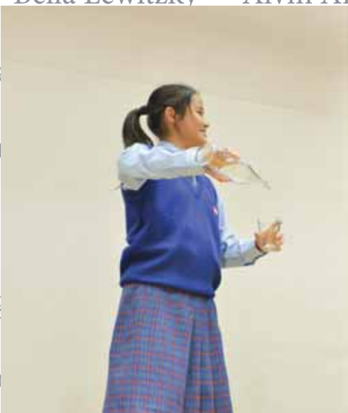
Bella Lewitzky Alvin Ailey Pina Bausch