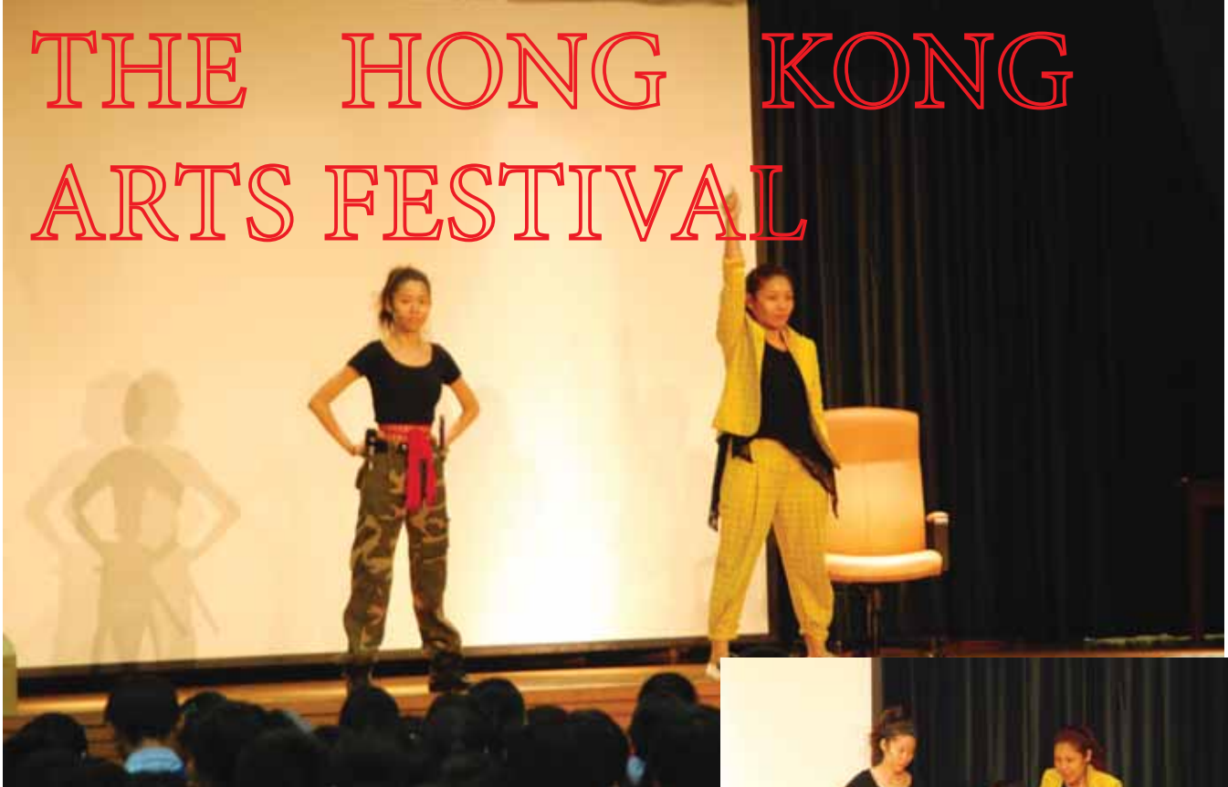
Our guest asking our student's question