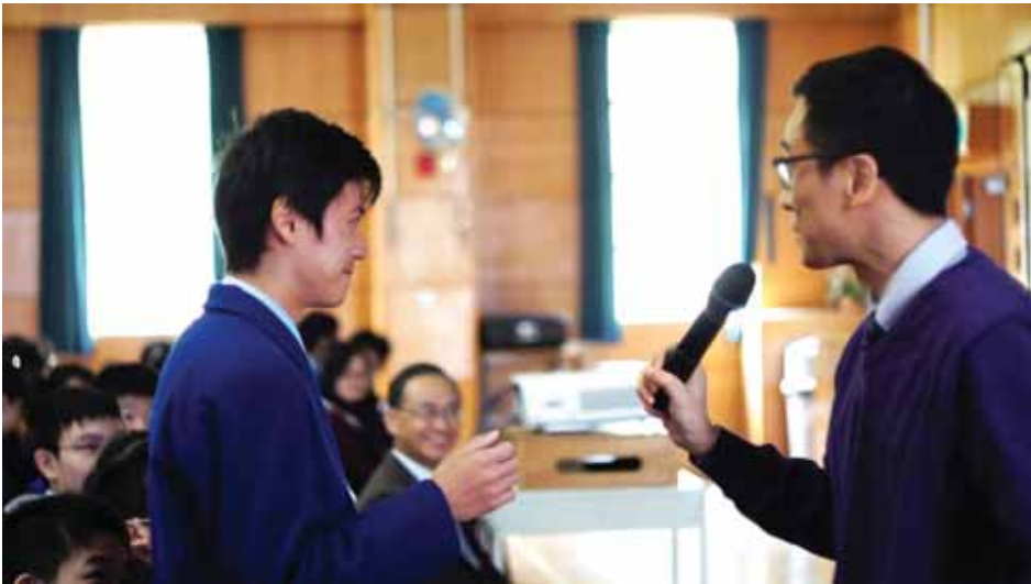
Our guest asking our student's questions