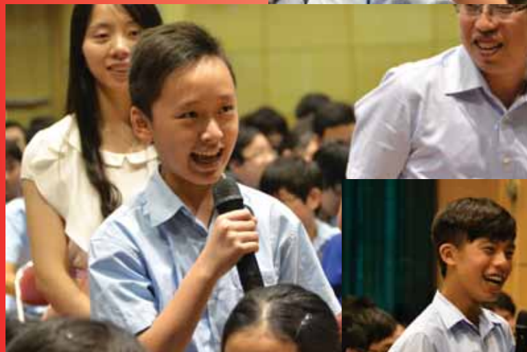
Independent Film Sharing