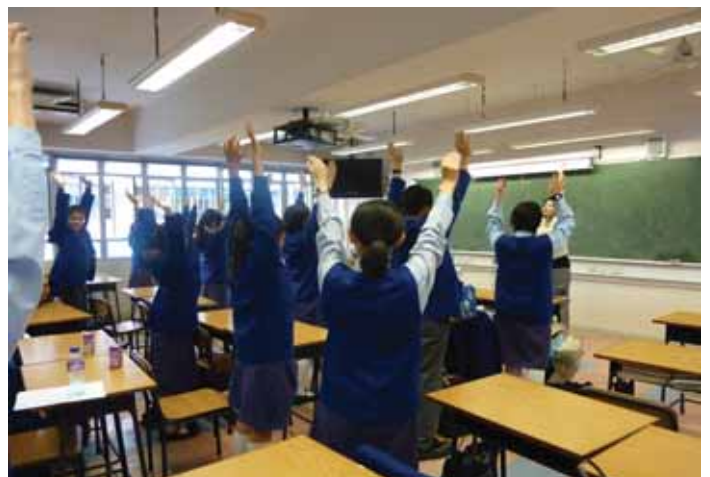
Students doing the warm up exercises

Organization: Hong Kong Youth Arts Foundation Limited